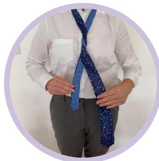
6. Continue to wrap the wide end around the narrow end until the is in the same position as before