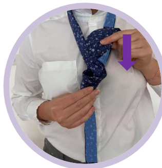
9. Slightly open the front of the knot and push the wide end down through the small opening.