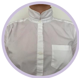
1. Start in front of a mirror Turn collar up