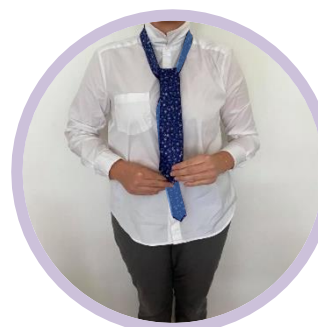
8. To look like this