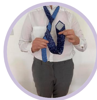
7. Bring the wide end behind the knot and pull it through the opening at your neck.