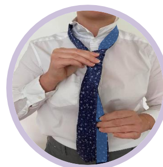
10. Slowly pull both ends down to tighten the knot. Whilst you are still holding the narrow end with one hand, use the other hand to slide the knot up using side to side movements.