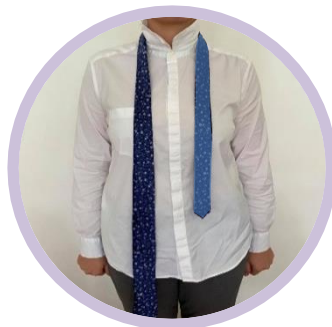
2. Place tie around your neck, making sure its not twisted