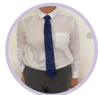
11. Turn collar back down.