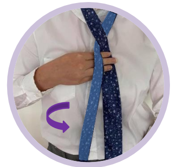
4. Then put your writing hand behind the tie and grab hold of the wide end