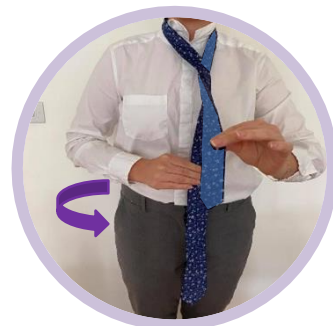
5. Wrap wide end around narrow end