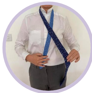
2. Whilst holding the narrow end, place the wide end over the top and let go of the wide end