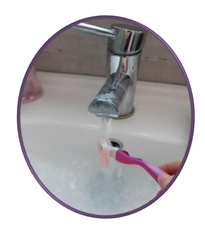
6. Rinse razor under water to remove hair and repeat until area has been shaved.