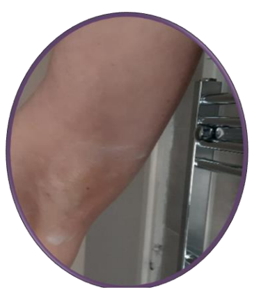
3. Apply shaving foam to area for shaving. Alternatively, rub soap between wet hands to create lather and apply to area for shaving.