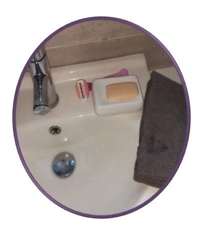
You will need a razor, soap/shaving foam, water and a towel.