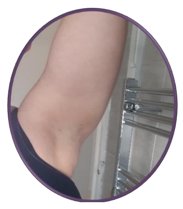
2. Position your arm straight up and over your head. Rest forearm on head if more comfortable or let hand rest on your shoulder blade. Face a mirror for a better view. Ensure that you have as flat a surface as possible.