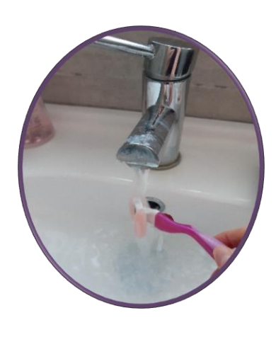
4. Rinse razor under running warm water. Ensure it is clean, rust-free and safe for use prior to use.